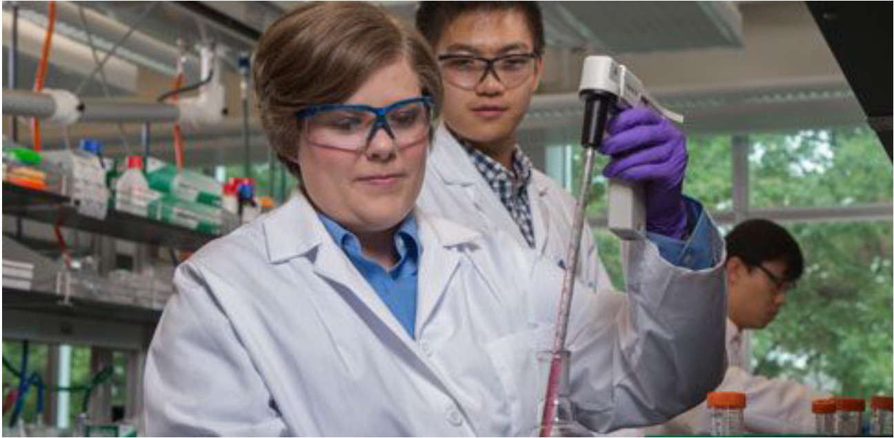
Bioengineering students at SUNY Binghamton

1997 through 2005, the proportion of freshmen planning to enroll in STEM fields declined, hitting a low in 2005 of 20.7 percent. After modest gains in 2006 and 2007, real increases started to show up in 2008.