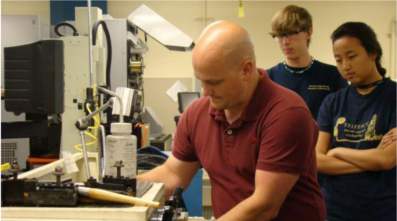
A veteran in Pittsburgh's summer program works in a machine shop.