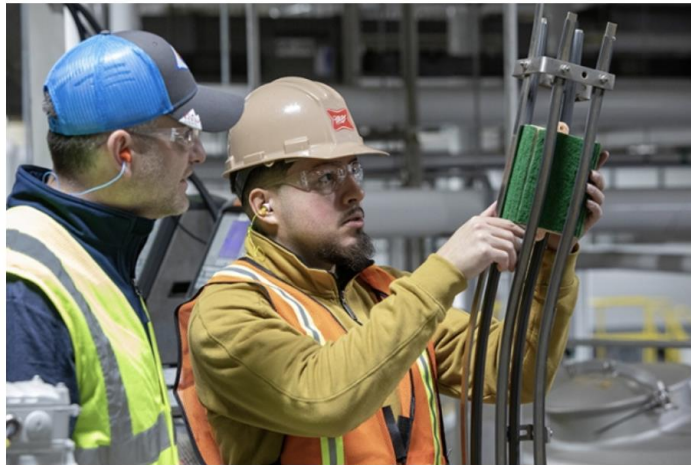
A UW Milwaukee student intern works alongside an employee at the Molson Coors beverage company.