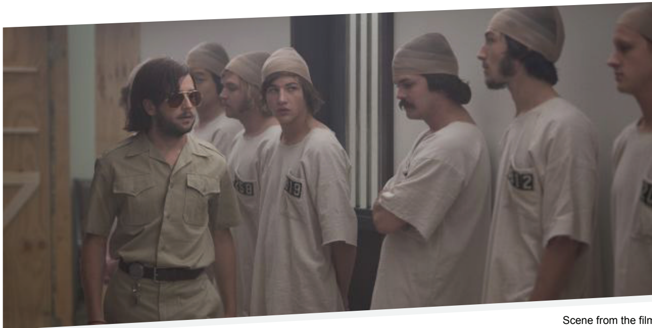
Scene from the film

at the American Psychological Association being complicit in the torture of others by U.S. agencies emerge.