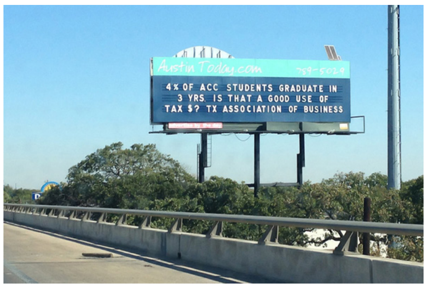
Texas Association of Business

Our students are not experiencing us just as single institutions, but as ecosystems or networks of higher education institutions, generally in a reasonably well-defined region. They swirl in and among, stop out, start back, change majors, change departments, change colleges. And because this was exceptional 50 years ago, when we were in college, we continue to think it is the exception. It is now the norm and likely to remain so. For policy makers, decisions on the outcomes of investing in higher education will need to be framed around the ecosystems.